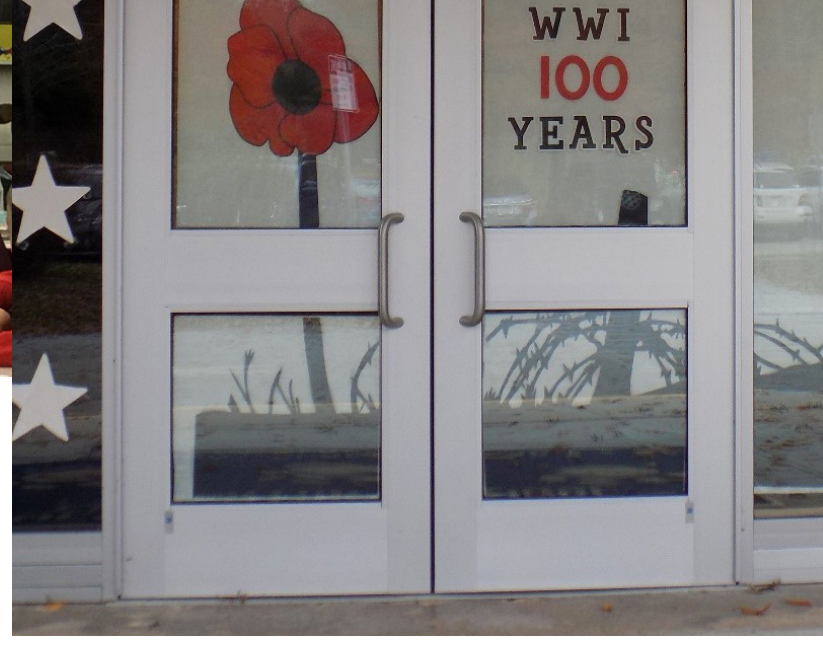
In November 2018, to acknowledge the 100th anniversary of the end of World War I, we showcased the official Veterans Day poster from the Department of Veterans Affairs on our main doors.